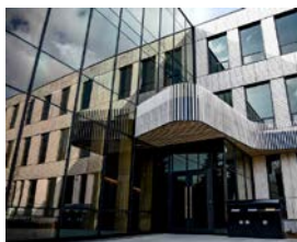
New College of Forestry Facilities