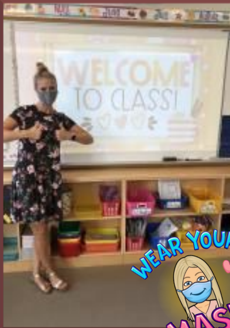
Masks and Social Distancing