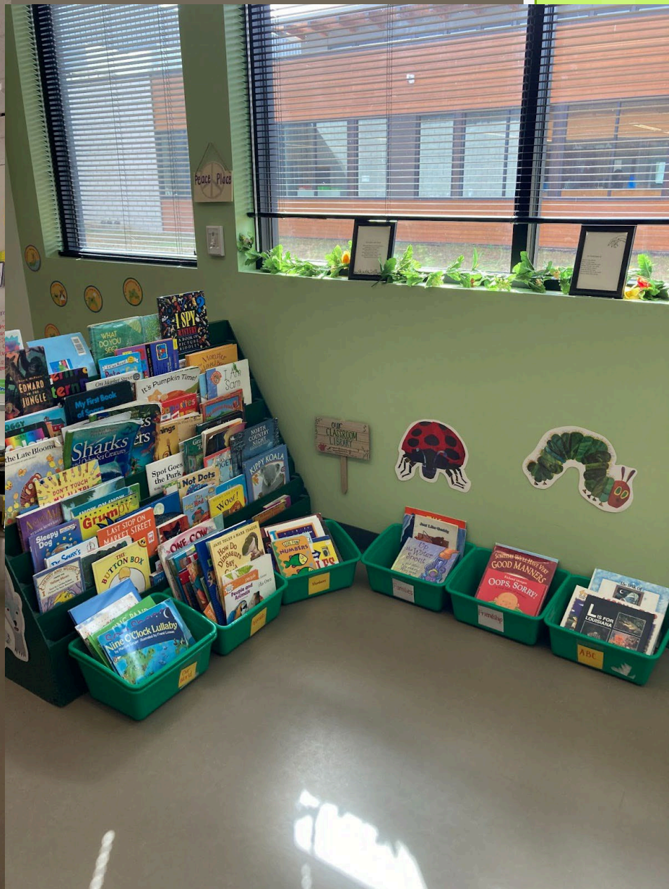
Inside a Kindergarten classroom.