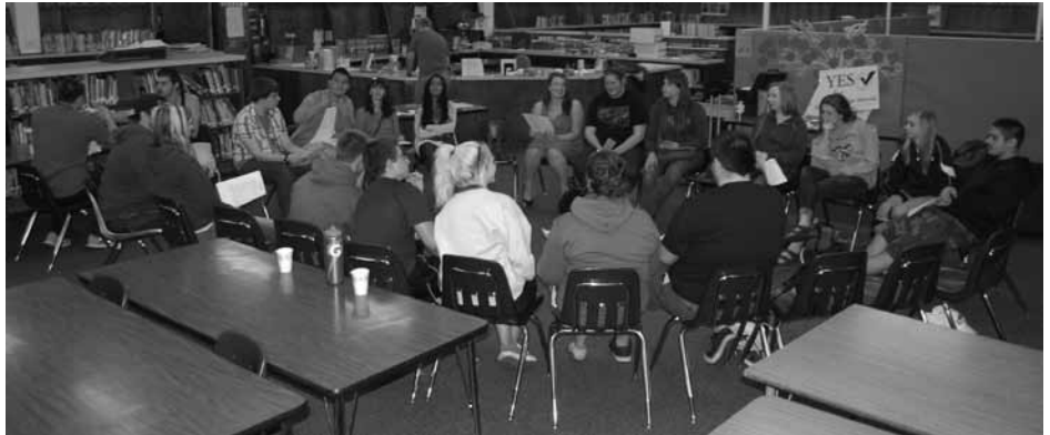
Outdoor school counselors meet at Fern Ridge Middle School to prepare.

"I'm not excited to die afterwards because lots of energy goes into it [being a counselor].