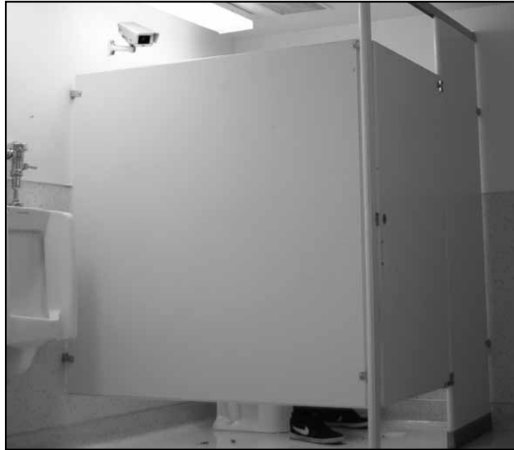
Elmira High School student uses bathroom while watched by a camera.

Of course, for the district administration, this is a safety issue. They want to be sure that if there are further bomb threats or graffiti they know