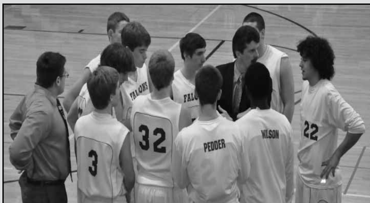
The basketball team confers during a time-out.

Nevertheless, winter sports teams have been working and practicing daily as they always have. The men's basketball team currently holds a 3-7 record, but remains