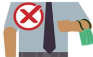
On your arm