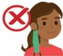
Dangling from one ear