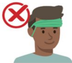
On Your forehead