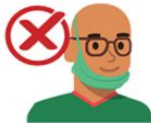
On your chin