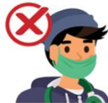
Under your nose