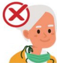
Around your neck