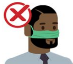
Only on your nose