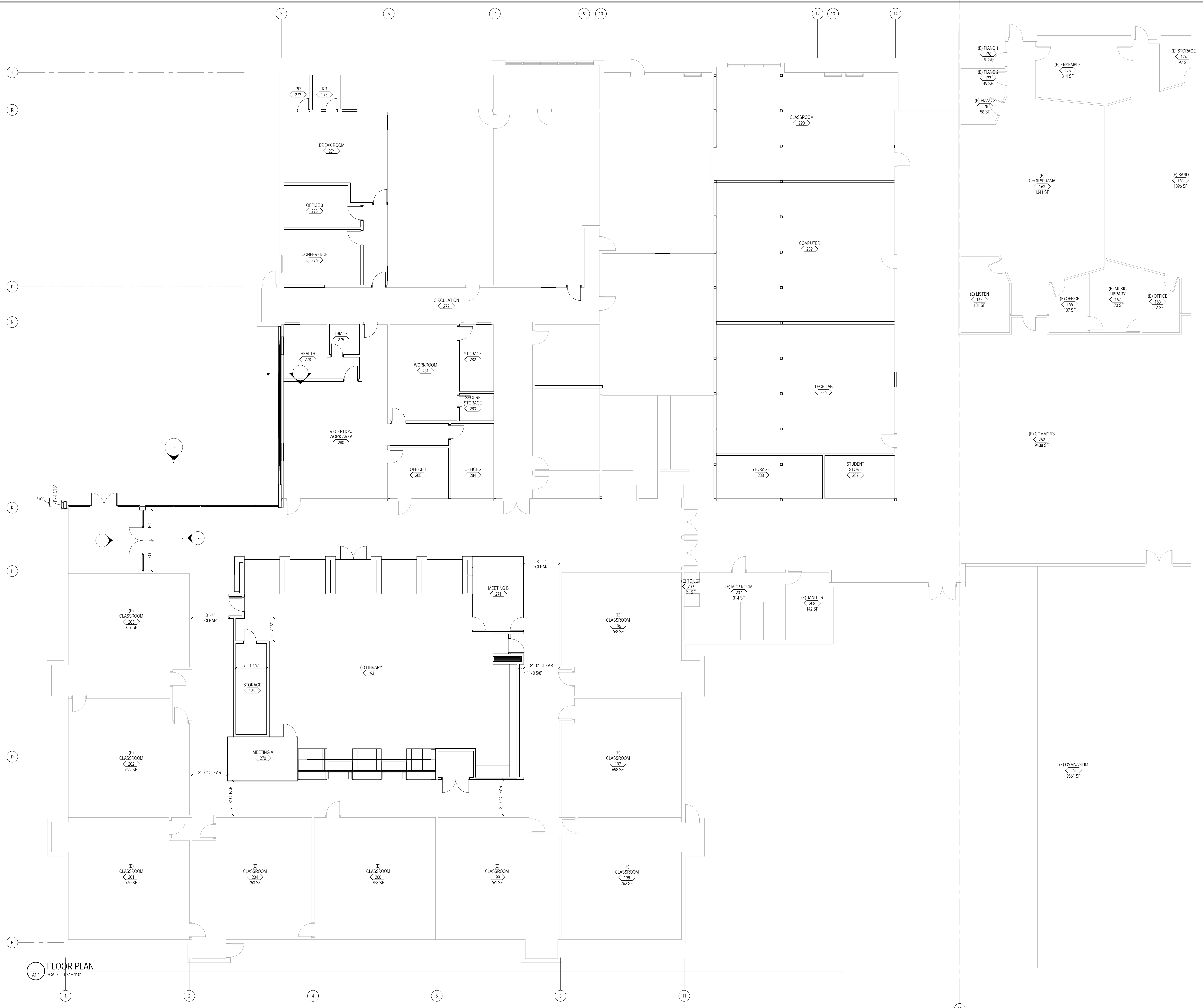
1 FLOOR PLAN A11 SCALE: 1/8" = 1'-0"

C:\Revit\15107-30_FRMS_AR_2015_Central_Edisher.rvt 3/10/2015 1:20:47 PM